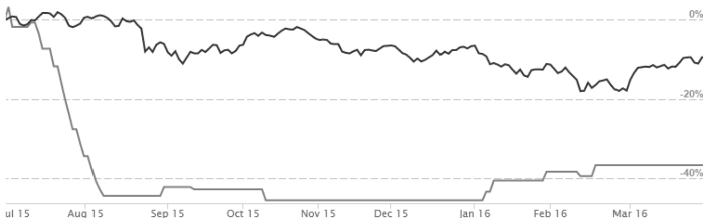
Historic Graph 01-07-2015 to 31.03.2016